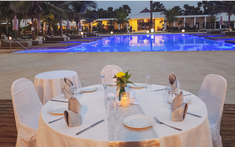
From D10,000 Incl Tax